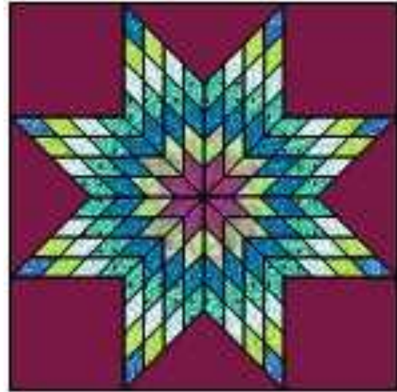
Fabric for Borders