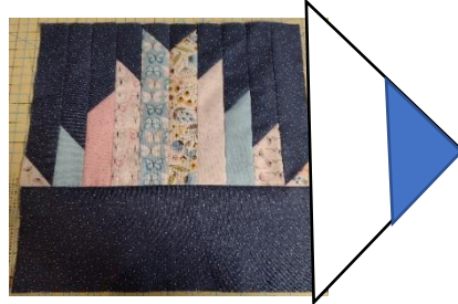
Figure 1 – 13" Square from Part 6